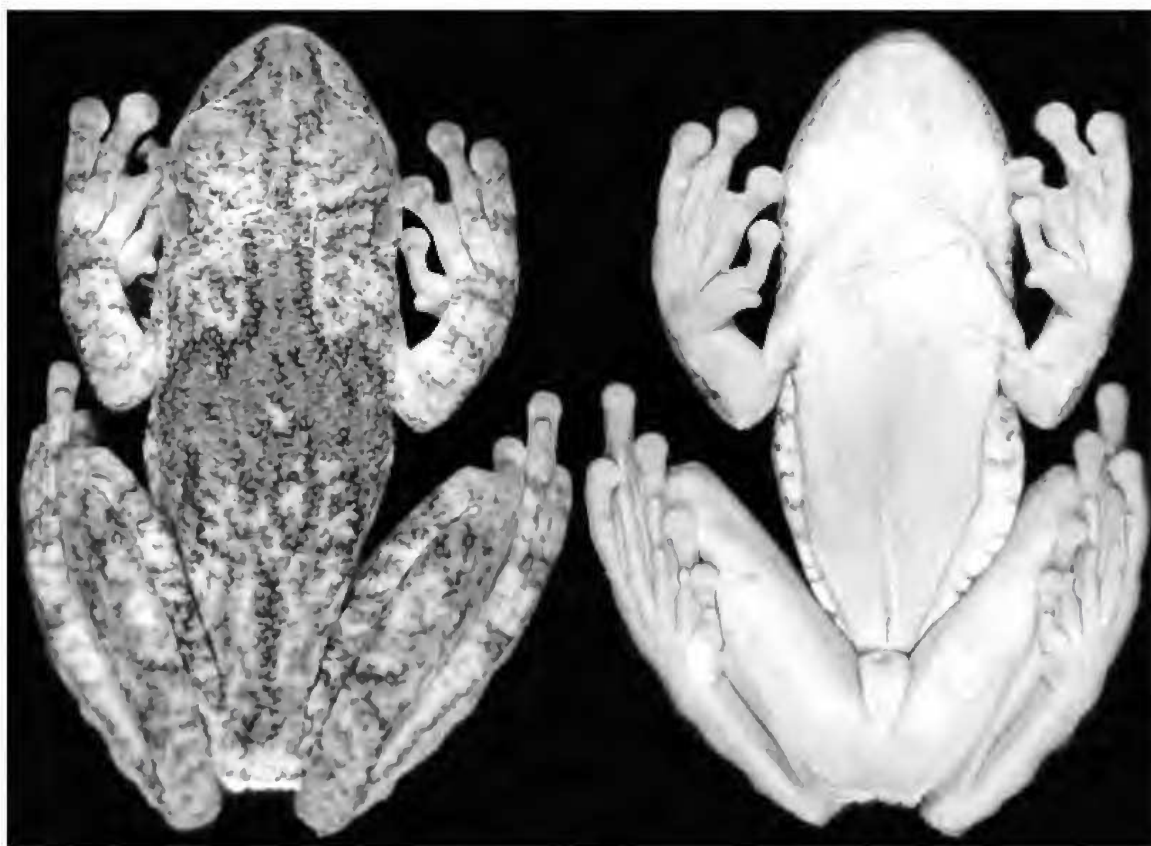
Fig.1- Dorsal and ventral views of Hyla exastis sp.nov. (MZUSP 63540, holotype; SVL 99.0mm).

Diagnosis – A treefrog morphologically belonging to the H. boans species group and related to H. pardalis and H. lundii , characterized by: (1) large size (SVL 81.1-99.0mm in males, 86.5mm in female); (2) dorsum granulose; (3) a developed crenulate fringe along external border of forearm, finger IV, foot, and toe V; (4) calcar appendix conspicuous; (5) anal plate distinct, inferiorly delimited by a transverse row of white tubercles; (6) dorsum grayish yellow (in life) or brown (in preservative), with dark brown to black marks without forming a definite pattern and resembling tree bark with lichens; (7) in life, palm of hand bluish yellow, fingers and disks deep blue, and webbing yellowish gray; sole of foot gray, toes and disks deep blue, and webbing black; (8) palmar formula, I 2 - 2 + II 1 - 2 - III 1½ - 1 IV; (9) plantar formula, I 1 - 1 II 1 - 1½ III 1 - 1½ IV 1½ - 1 V.